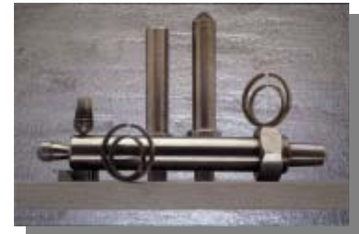
<13>熱室機用射咀身, 射咀頭及鋼吟 Extensions in special steel for OLZ machine