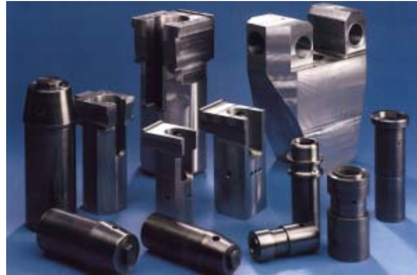
<4>熱室機精鋼鵝頸-Goose-necks for Hot chamber Die-casting Machines