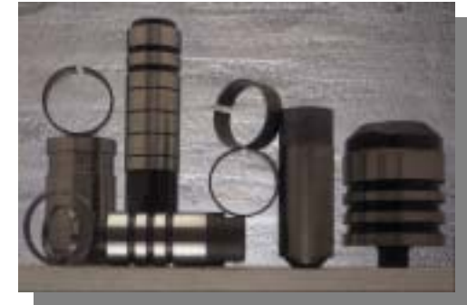
<11>熱室機用鎚頭及鋼吟 Series of cast-iron and steel ring for Hot chamber