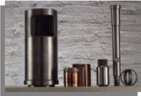
<1>冷室機壓射司筒, 鎚頭, 鎚頭身及鎚頭吟 Shot sleeve and pistons for cold chamber