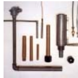
<9>熱室機用電熱套, 熱電偶 Heating Element & Thermocouple