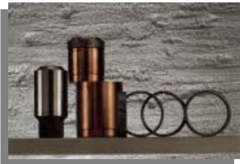
<2>冷室機鍍銅鎚頭, 鋼鎚頭及鎚頭吟 Series of pistons for cold chamber