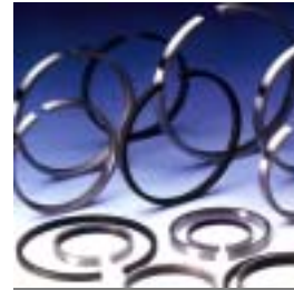
<6>日本 NPR 直口鋼吟(熱室機用) Steel Ring for Hot chamber