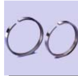
<7>日本 NIC 直口鋼吟(熱室機用) Steel Ring for Hot chamber