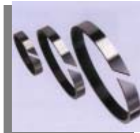
<5>西德 K.V 斜口鋼吟(熱室機用) Steel Ring for Hot chamber