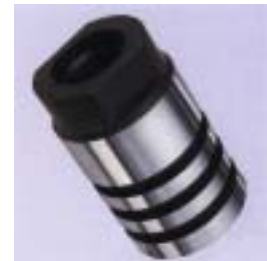
<10>熱室機用鎚頭 Piston for Hot chamber