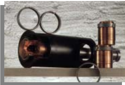
<3>特殊鋼材製造冷室機壓射司筒, 鍍銅鎚頭及鎚頭吟 Shot sleeve, pistons in Cu Be Co with Special steel ring for cold chamber