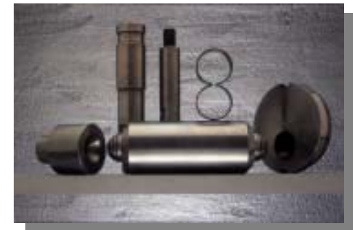
<12>熱室機用射咀, 彎形咀及延長射咀身 Diffuser-extension Nozzle – siphon beck injector piston